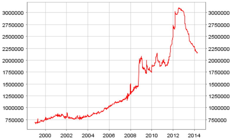
Fig. 2: Total of asset of ECB – millions of euros