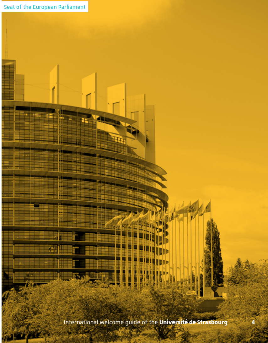
Seat of the European Parliament