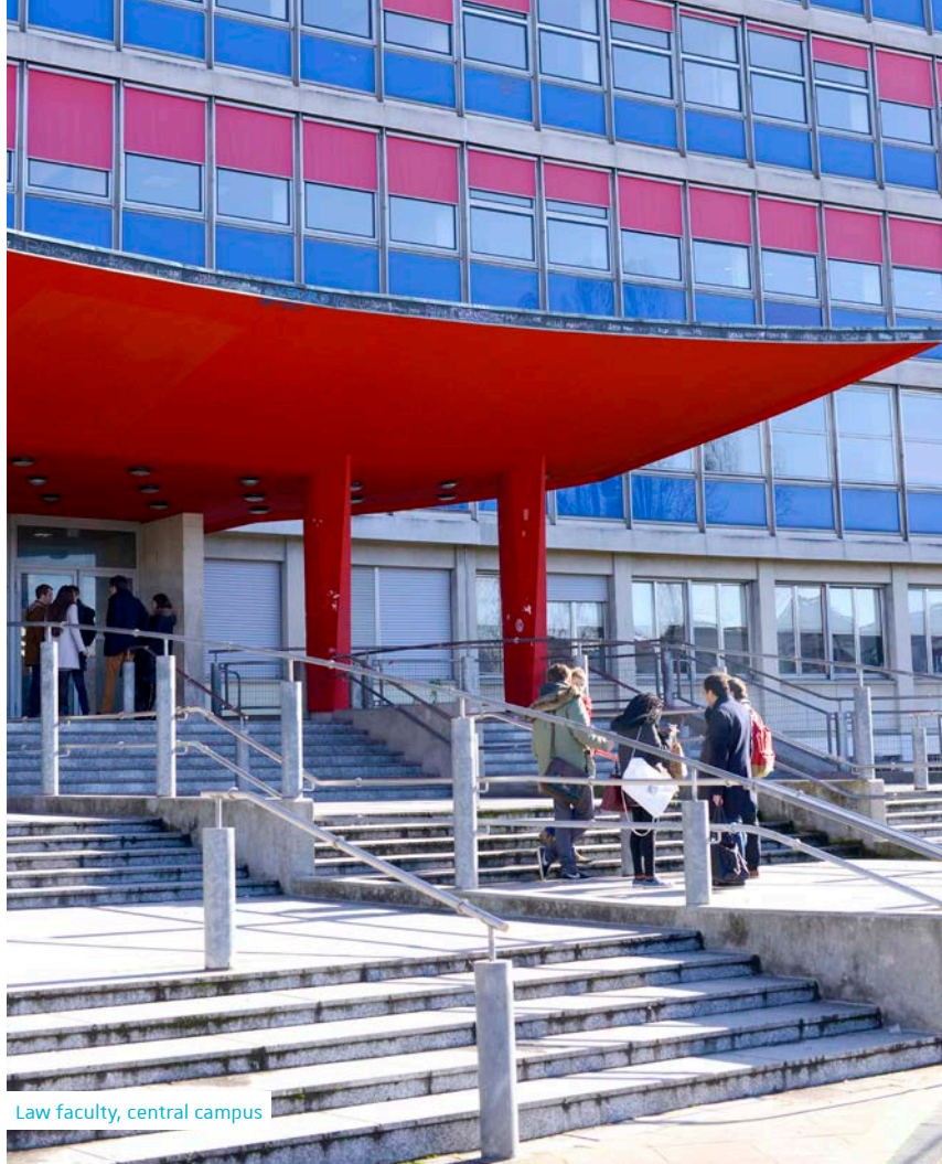
Law faculty, central campus

Most classes will be held in French. Thus, a B1 (even B2 for certain subjects) level in French is required for a period of study at the Université de Strasbourg within the framework of an exchange.