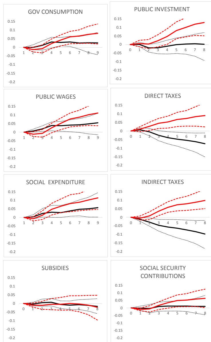
Figure 3: Spread impulse responses to shocks in budgetary determinants: full sample and Global Financial Crisis period

Note: Errors are 5% on each side generated by Monte-Carlo with 500 replications. Black lines correspond to the entire time span, whereas red lines correspond to the global financial crisis period, i.e., from 2007Q3 onwards.